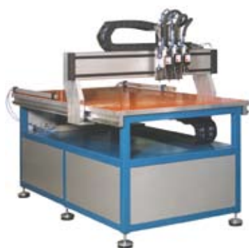
KTS-1550 CNC coordinate table without casing and equipped with three welding heads (option)