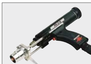
The PH-3N welding gun is the standard gun for the BMK-12W stud welder